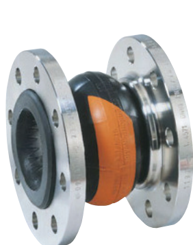
DN 20 - DN 400

Universal expansion joint DN 20 – DN 1000