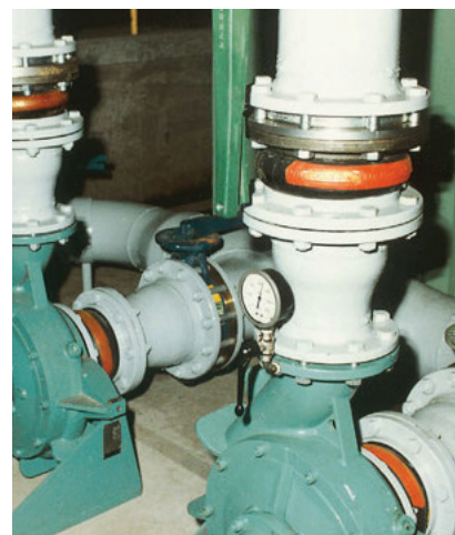
STENFLEX® type A-1 used at pumps