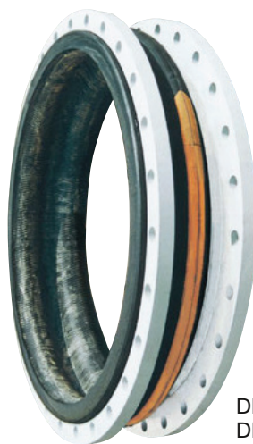
DN 450 - DN 1000